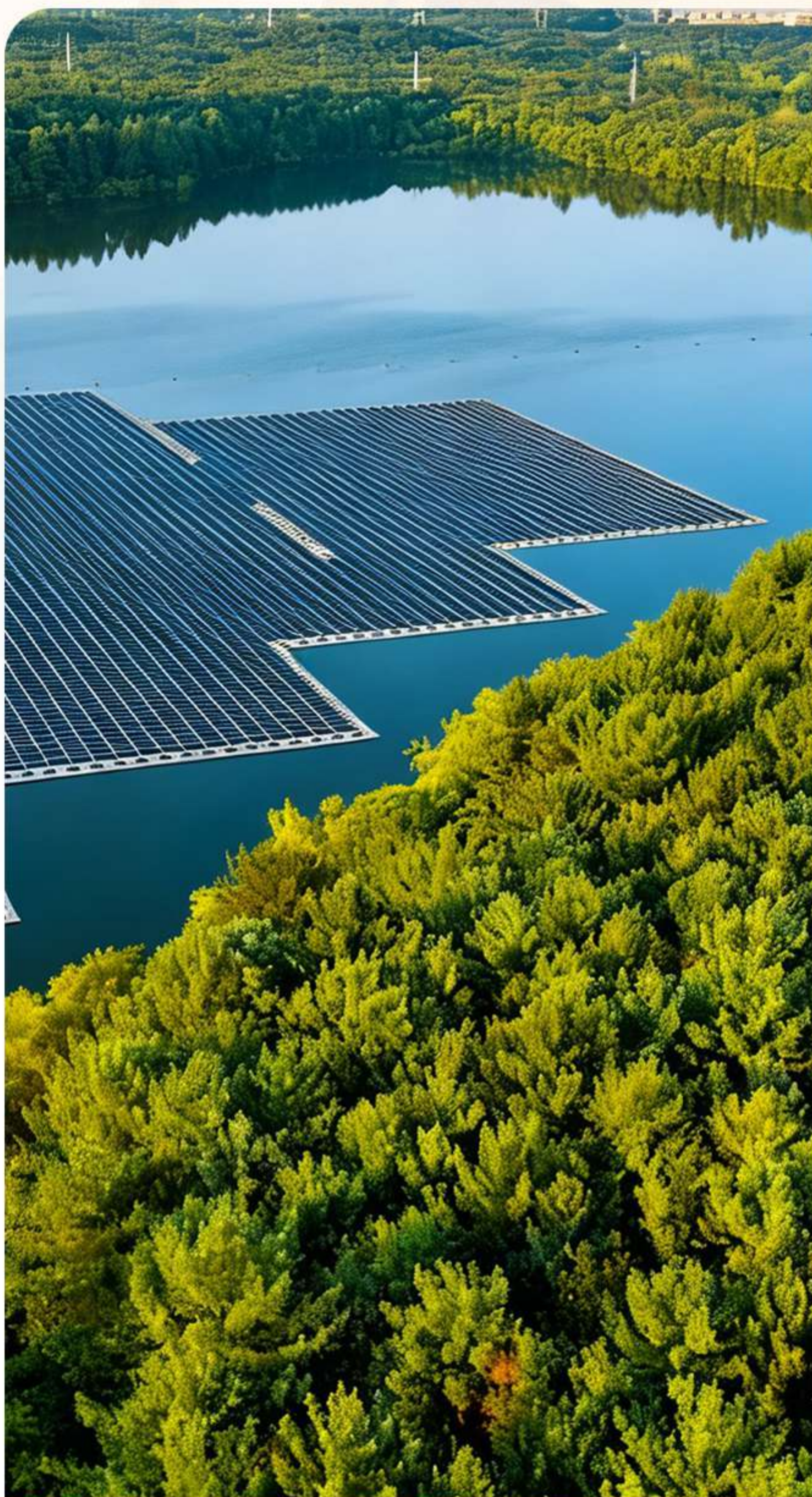
Renewable Energy Development

SMI is actively developing strategic partnerships with regional governments, including Lampung province, focusing on: