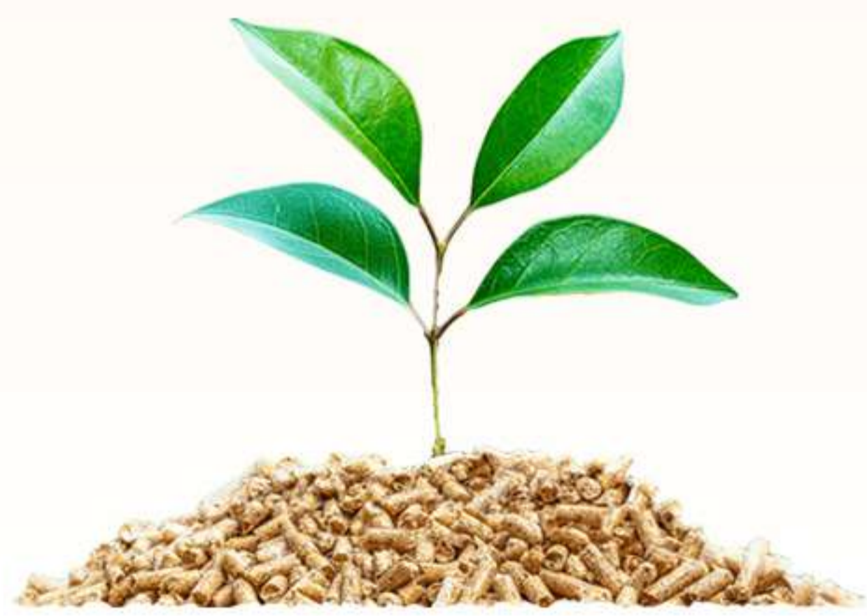
Feedstock Sourcing (biomass & waste)

SMI's competitive advantage lies in its ability to deliver fully integrated solutions , including: