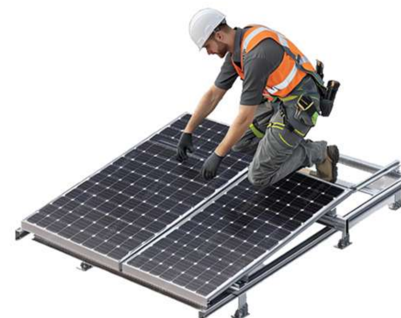
Operations & Maintenance