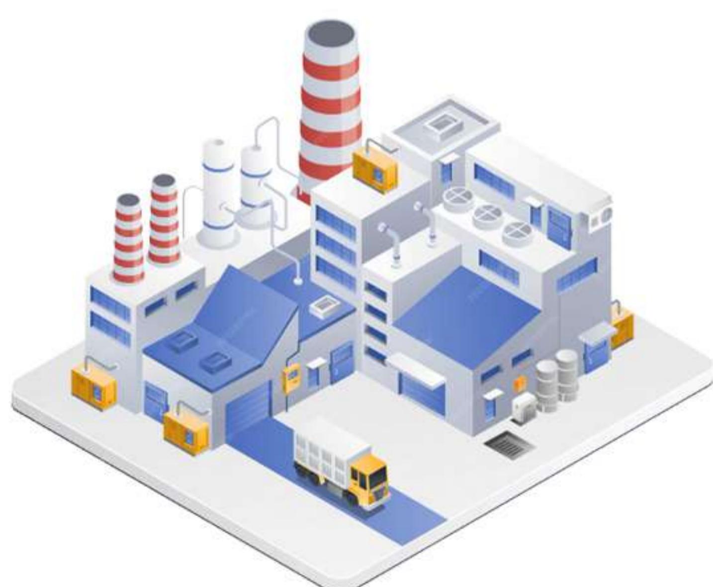
Industrial Ecosystem Integration

This approach ensures efficiency, cost optimization, and long-term sustainability for every project.