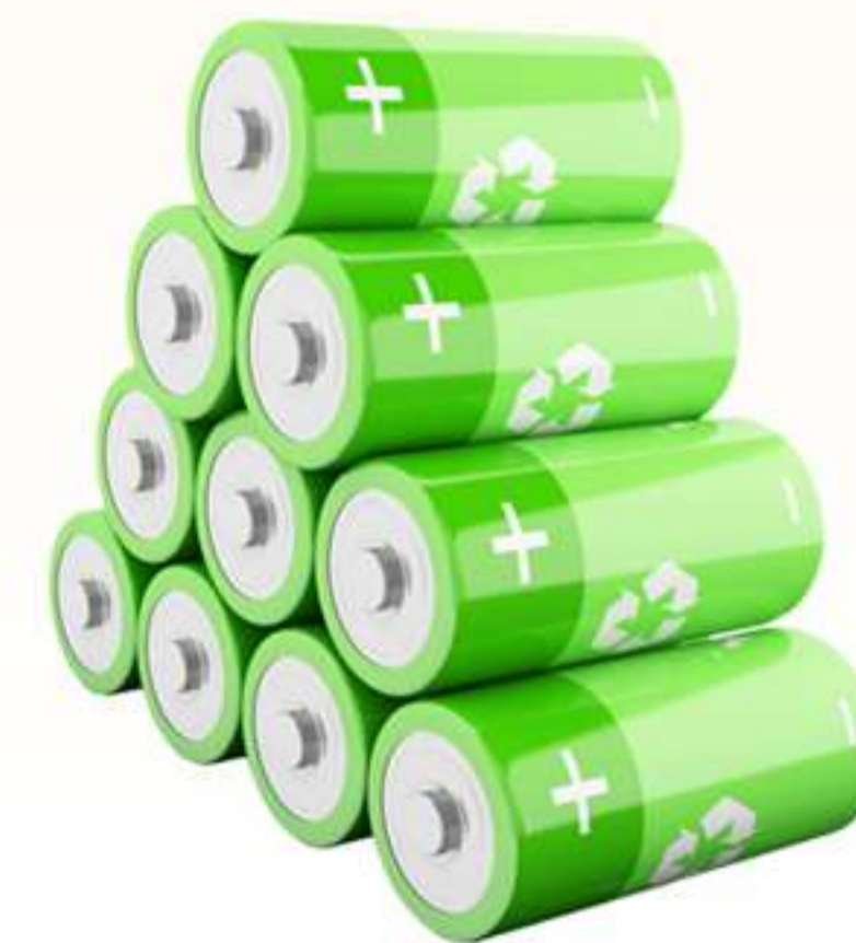
Energy Conversion Technologies