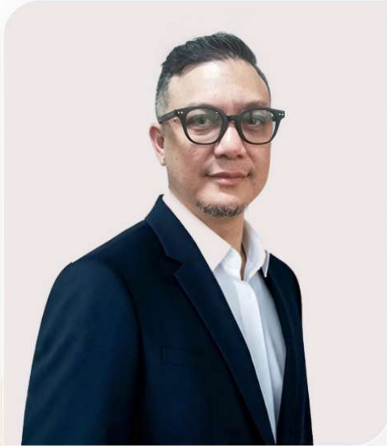
Alfatiha Baharnuradi Commissioner