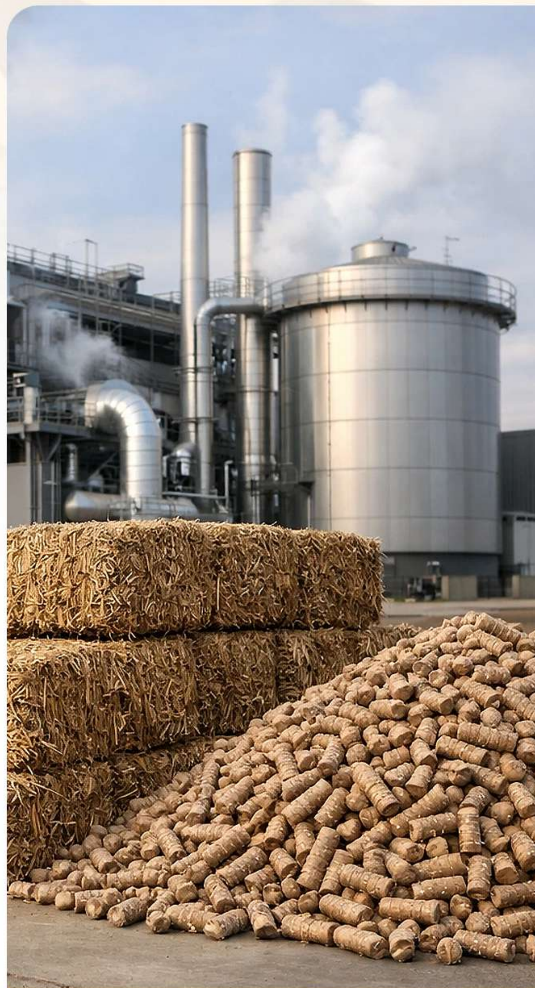
Energy Plantation Generation